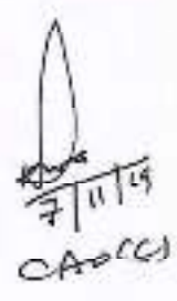
% FOR 52KG RAIL ON GAUGE FACE