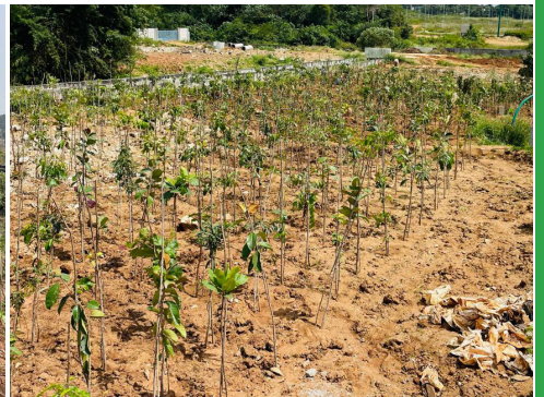
Greening Bengaluru through Compensatory Afforestation 🟢 87,000 saplings planted at GKVK and NPKL under a 1:10 plantation ratio with BDA & BBMP, reflecting KRIDE's dedication to Sustainable Urban Infrastructure.