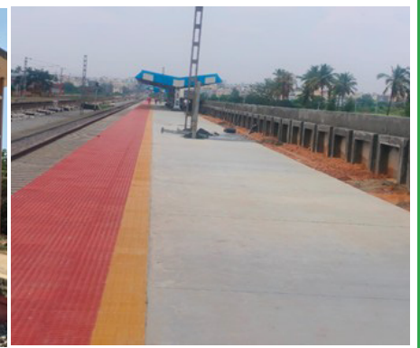
Br. No. 474 (Major Bridge), Anekal station building works, and platform works for temporary track diversion at Bellandur Road station have been completed.