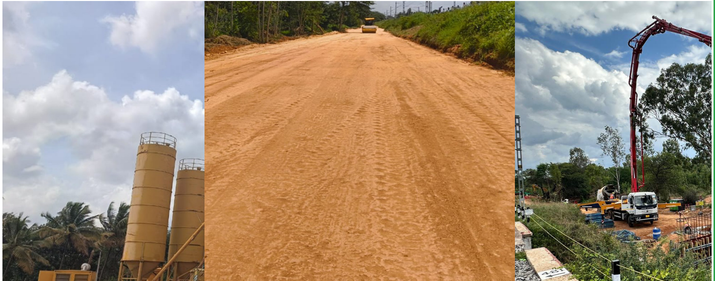
Establishment of Batching plant at Casting yard, Minor Bridge construction, Earth works in formation for Corridor-4 is in progress.