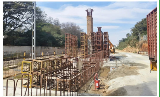
Raft Reinforcement works at Banasawadi, Fixing of Pier shutter for P7 and Portal Beam Crib staggering works is in progress for P2 & P3 at Kasturi Nagar of Mallige line.